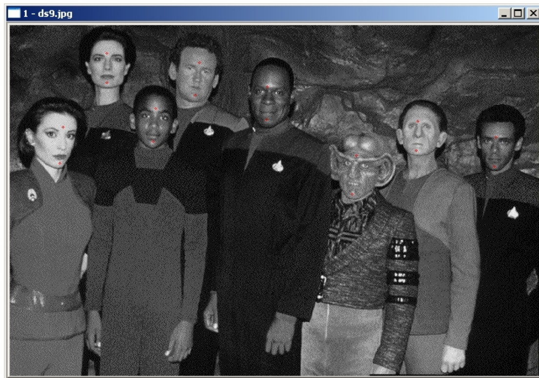
Figure-3: objects marked by points

This application, apart from being used to mark objects of interest, can also be used to crop the objects of interest based on the information in the file 'annotation.txt'. When the program is invoked without any parameters, the program functions as an object marker, but when the program is invoked with a parameter (any parameter at all, for instance "ObjectMarker.exe -"), the program crops the objects out of the raw images based on the information in the file 'annotation.txt' and place the cropped images inside directory 'cropped' which resides in the same directory where ObjectMarker.exe is invoked. If the directory 'cropped' does not exist, user must create one manually. The produced images are in JPEG format and the size is hard-coded in the source code.